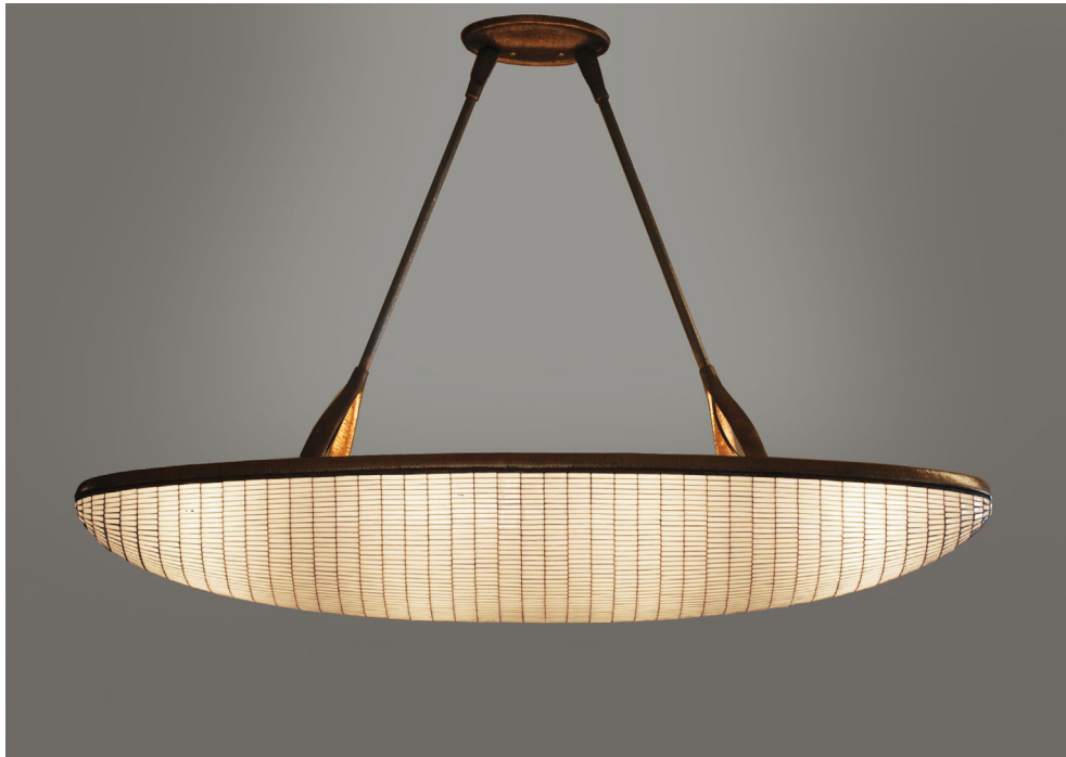
NILE PENDANT ( without downlight )