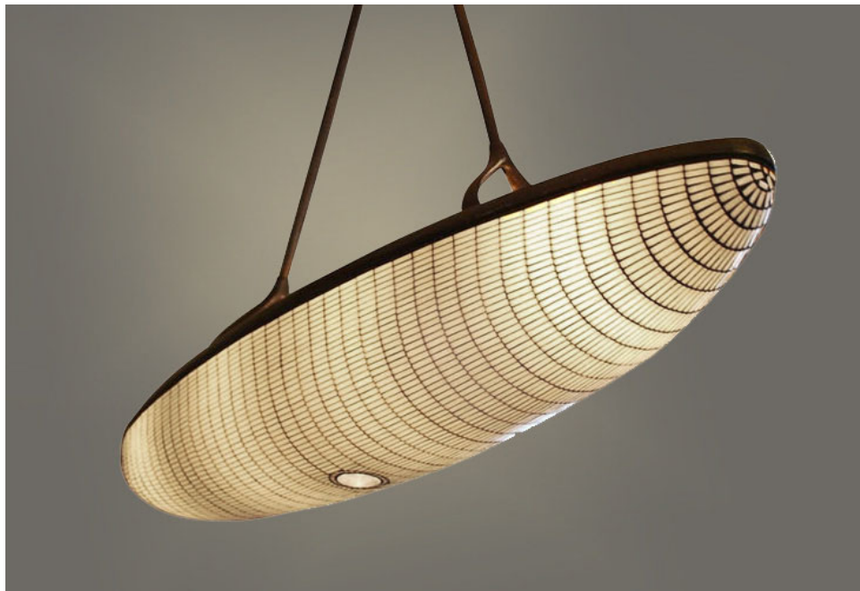
NILE PENDANT ( with downlight )