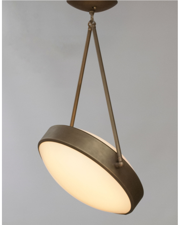
LILY WHITE GLASS - SATIN BRASS