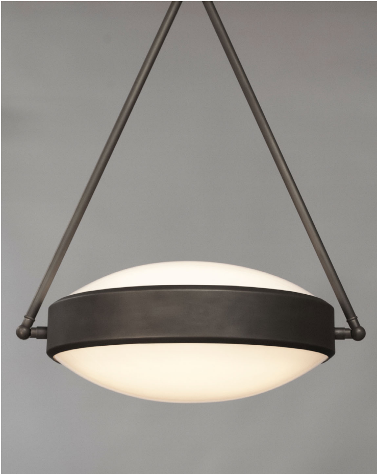
LILY WHITE GLASS - ANTIQUE BRASS