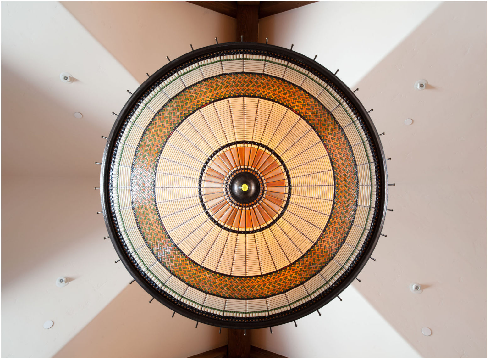
GRAND PARASOL CHANDELIER, *Weave Tile is an additional cost, refer to cover page for standard design*