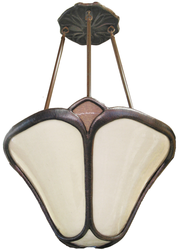
Glass Opt. Ivory