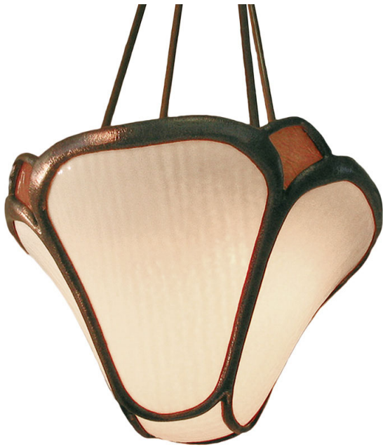
Glass Opt. Blush