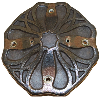
Detail of our Canopy unique to only the Dogwood Pendant