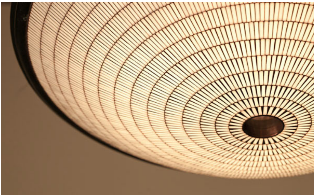
THATCHED CHANDELIER (images with downlight)